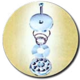
Disc and spring valves for long reliable service