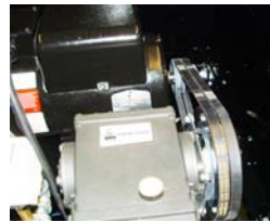
Pump-Saver Clutch System: Eliminates bypass overheating