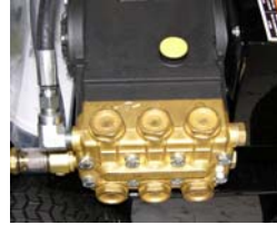
General Pump: Limited lifetime OEM warranty on head