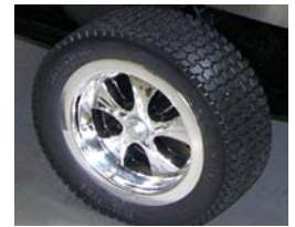
Flat-free Tires & Mag Wheels: Holds up in the most rugged conditions