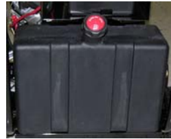
Fuel Tank: Corrosion proof polyethylene fuel tank