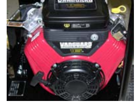
Vanguard Engine: Horizontal shaft, recoil & electric start