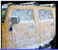
9114 – Super Red Powder

Keep customers happy with a Presoak System. Provides an additional option to address tough cleaning challenges. Presoak Systems are designed to apply a concentrated cleaning product to the surface of the vehicle. Easy Installation to your existing high pressure line to each bay that will apply Presoak Cleaner through your standard spray gun. All Advanced Cleaning Systems feature high pressure "blow down" allowing you to conserve weep water by blowing out your lines from the comfort of your heated equipment room.