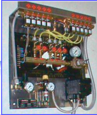
5 Bay Tri-Color Foaming Protectant & Conditioner Panel. Above picture shown with optional weep.

System includes a Multi-Compartment Tank with Hydrominder Valves. A space saving Wall Mount Air Pump Panel and Pulsing Solenoids send colored chemicals to the bays where a separate wand and hose assembly is used by the customer. All Advanced Cleaning Systems feature high pressure "blow down" allowing you to conserve weep water by blowing out your lines from the comfort of your heated equipment room.