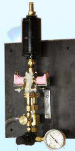
Economy (No Pump Required) Foam Brush System Available