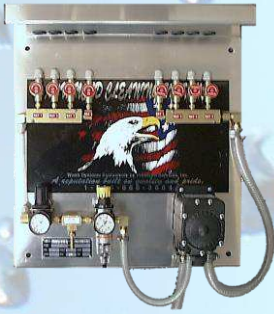
4 Bay Foam Brush Panel without Solenoids For: Dealerships, Equipment Bays, and Detail