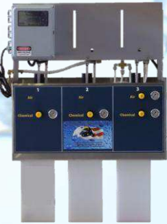
ACS Triple Foam Color Foam Brush System