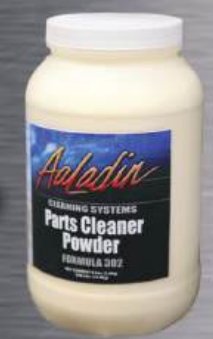
Detergents & Chemicals