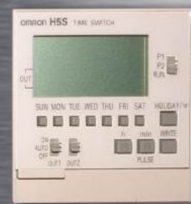
Why Worry About It

Our reputation for building top notch equipment isn't limited to parts washers... complete your AaLadin system with some of our many accessories.