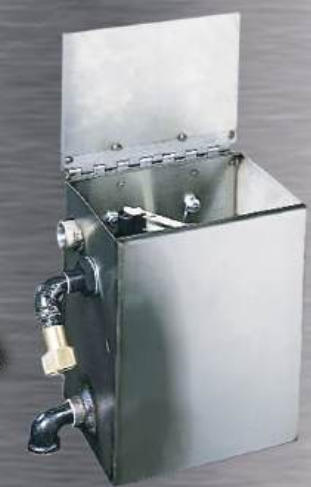
Stainless Steel Fresh Water Tank w/Low Water Shut-off