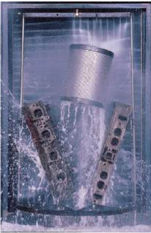
Wash parts cleaner & faster with AaLadin's 360° spray flow and 0° jets!