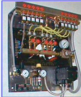
5 Bay Foam Brush Panel. Above picture shown with optional weep.

Stainless Steel 180° Wall Boom supplied with all units. This heavy duty boom is made of 304 Stainless Steel and is 6 feet long. The discharge coupling is 1/2+FPT. Boom Bracket mounts to the wall to allow 180° travel.