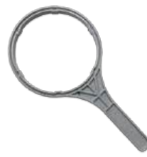
Filter wrench will assist in removing and attaching the filter housing for required maintenance of filter cartridge (included with PWR Series manual pack)