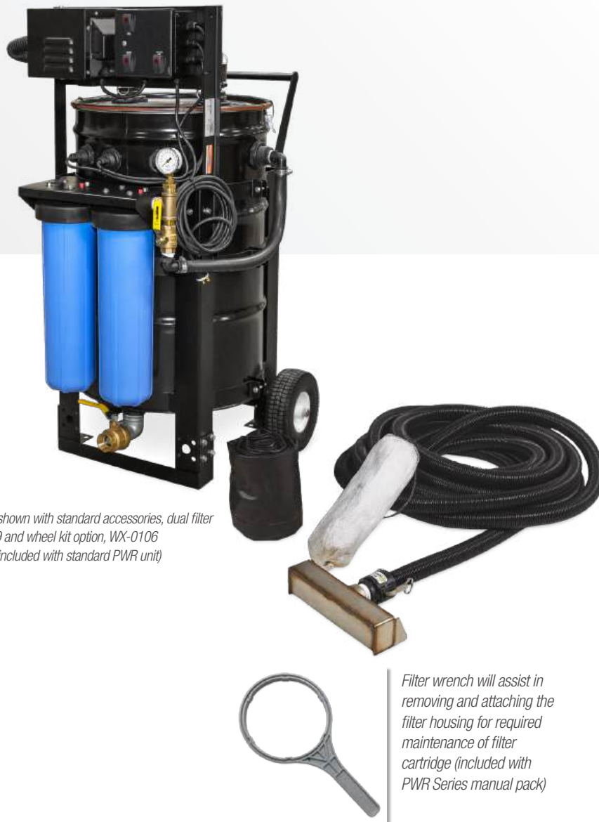
PWR-10-OME1 shown with standard accessories, dual filter option, WX-0109 and wheel kit option, WX-0106 (WX options not included with standard PWR unit)

THE PORTABLE WATER RECOVERY SERIES CAPTURES, FILTERS AND RECYCLES WASH WATER FOR REUSE OR PROPER DISPOSAL ON AND OFF JOBSITES.