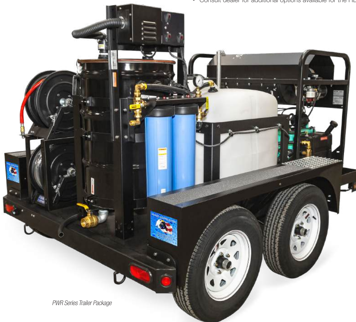
PWR Series Trailer Package