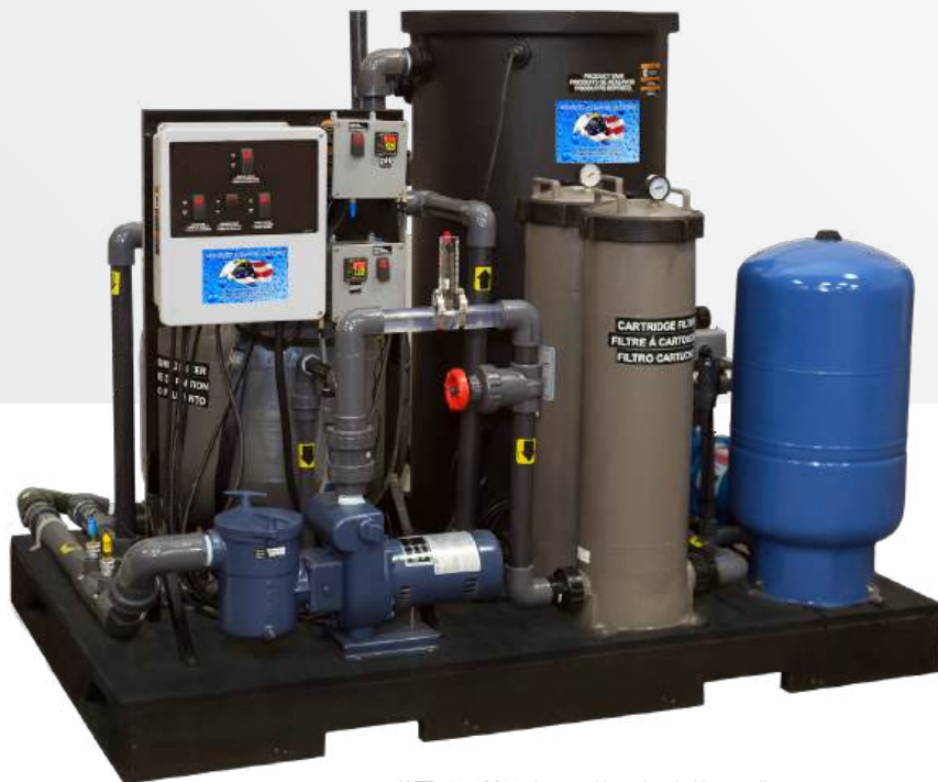
WTR-10-OM30 shown with optional pH controller, WX-0130 and ORP controller, WX-0131

ALL OPTIONS CAN BE ADDED TO THE WTR SERIES AFTER THE INITIAL SET-UP.