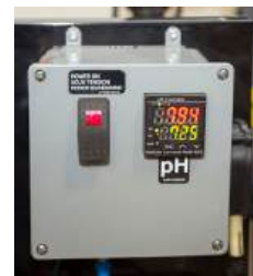
Optional pH controller, WX-0130