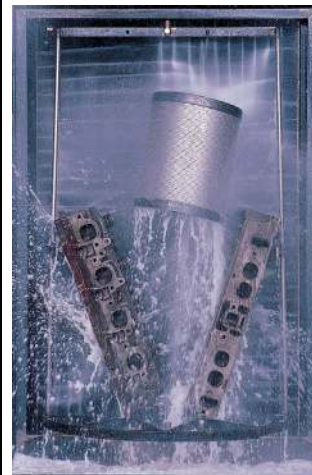
Wash parts cleaner & faster with AaLadin's 360° spray flow and 0° jets!