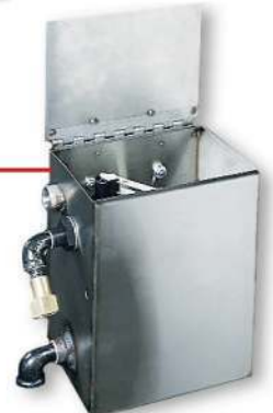
Stainless Steel Fresh Water Fill Tank w/Low Water Shut-off