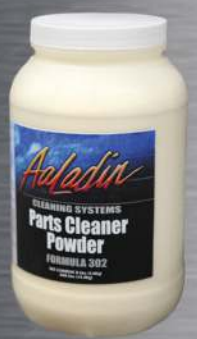
Detergents & Chemicals