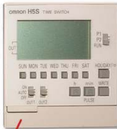
Why Worry About It