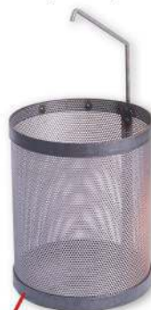
Small Parts Basket