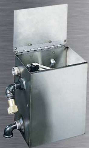
Stainless Steel Fresh Water Tank w/Low Water Shut-off