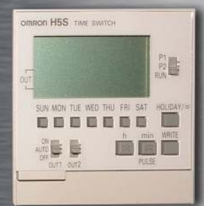
Why Worry About It

Our reputation for building top notch equipment isn't limited to parts washers... complete your AaLadin system with some of our many accessories.