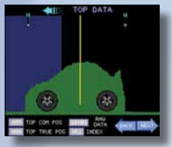
Digital Surface Profile - DSP