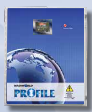
Profile Ultimate Control Cabinet