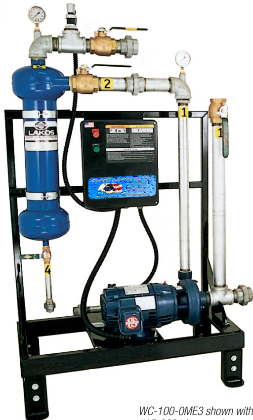
WC-100-OME3 shown with #15-2001 hose and #50-2001 hose reel options